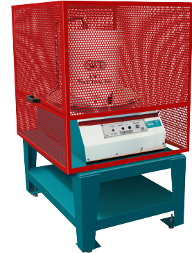
Tornado shown on optional stand and with optional safety screen