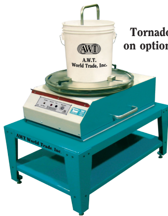
Tornado shown on optional stand.